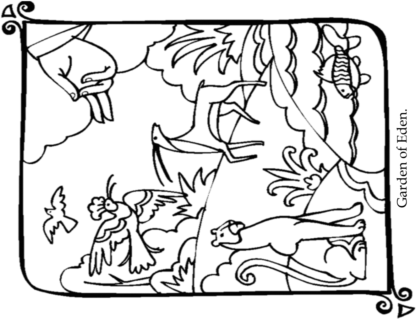
Garden of Eden.