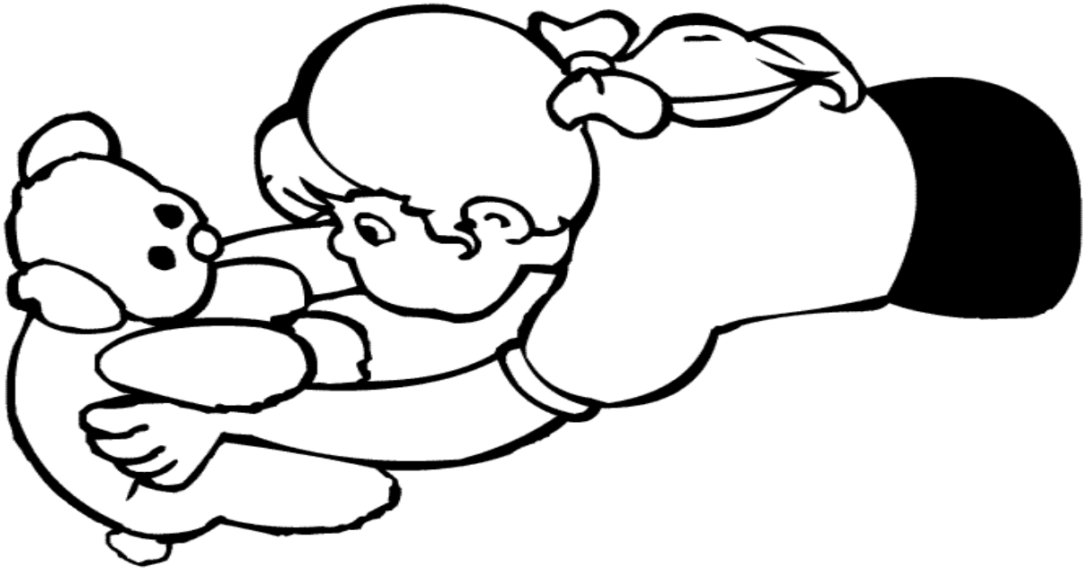
A New Teddy!!